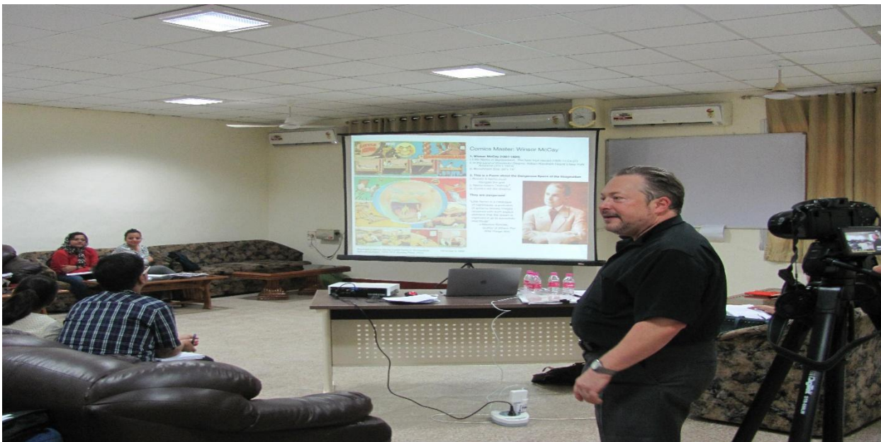
GIAN. Course Nov 2017